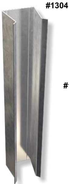
#1304 foam filled