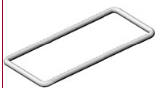
3/16" dia. Wall Tie

Wall Tie is welded 16" O.C. 3 point weld.